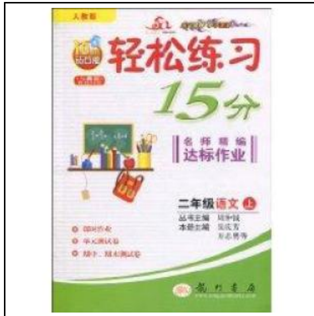
Filesize: 5.46 MB